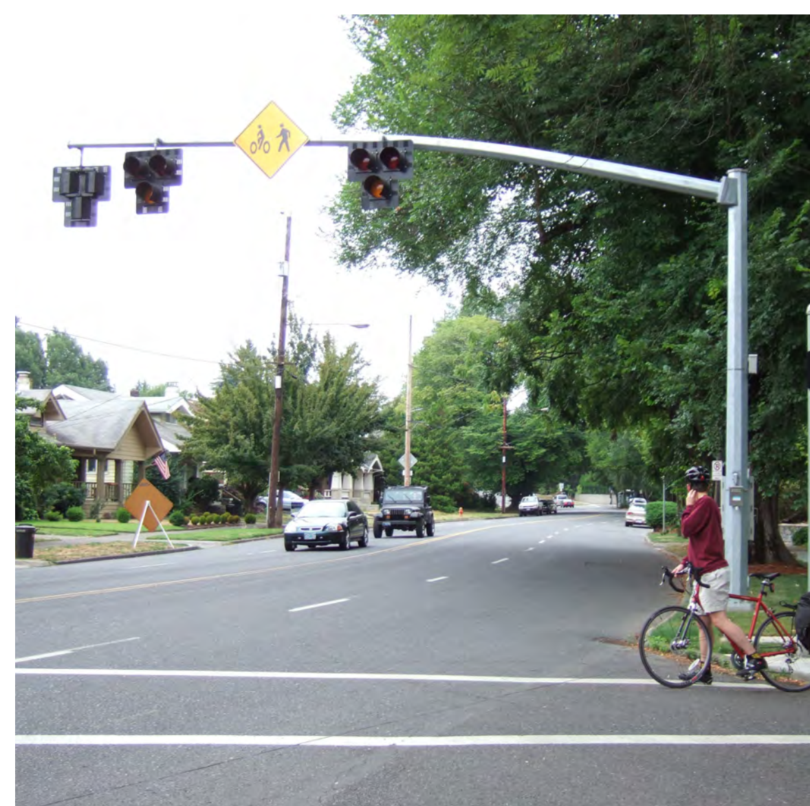
Provide frequent and safe crossing opportunities