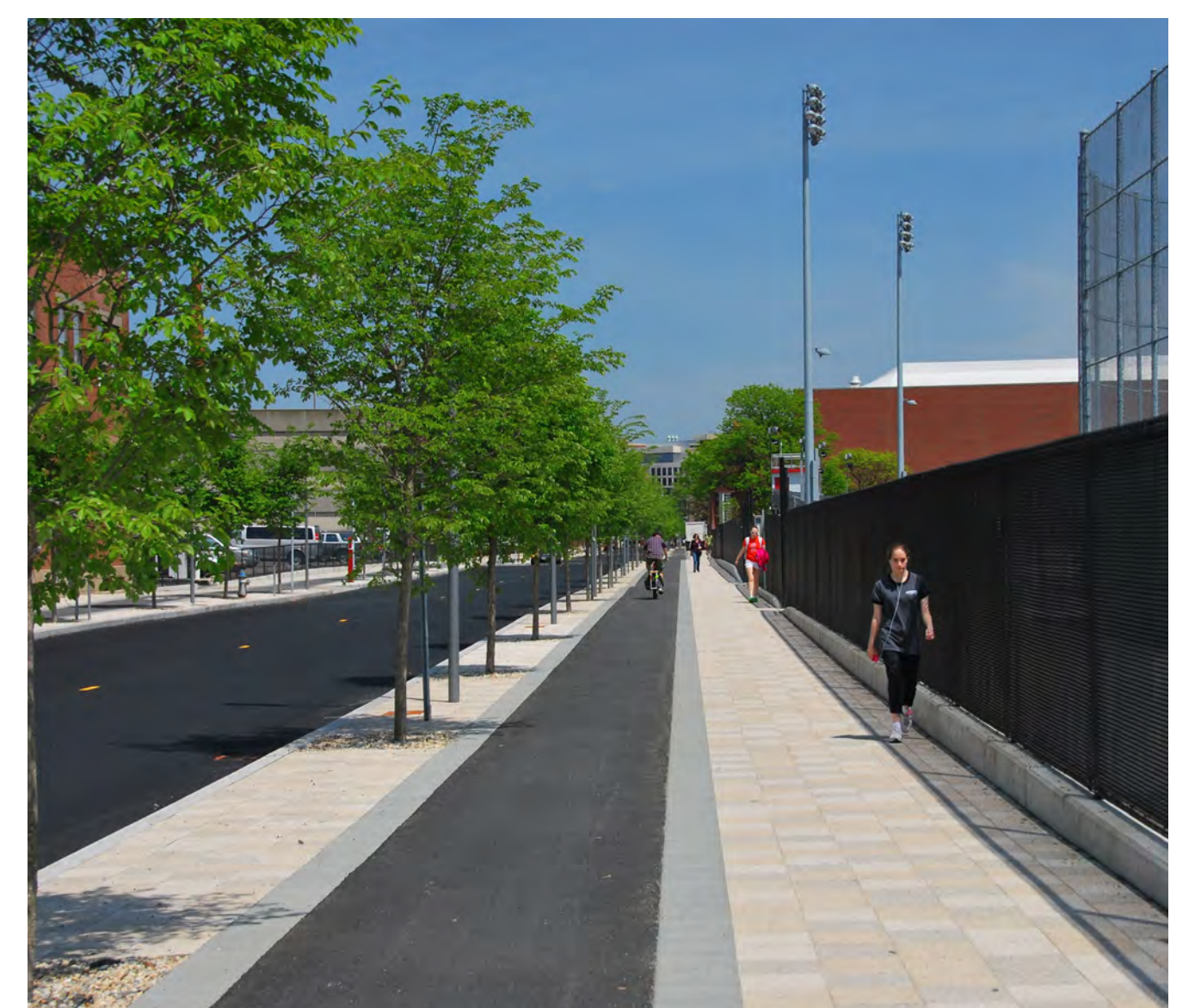
Dedicate bikeways separate from vehicular traffic