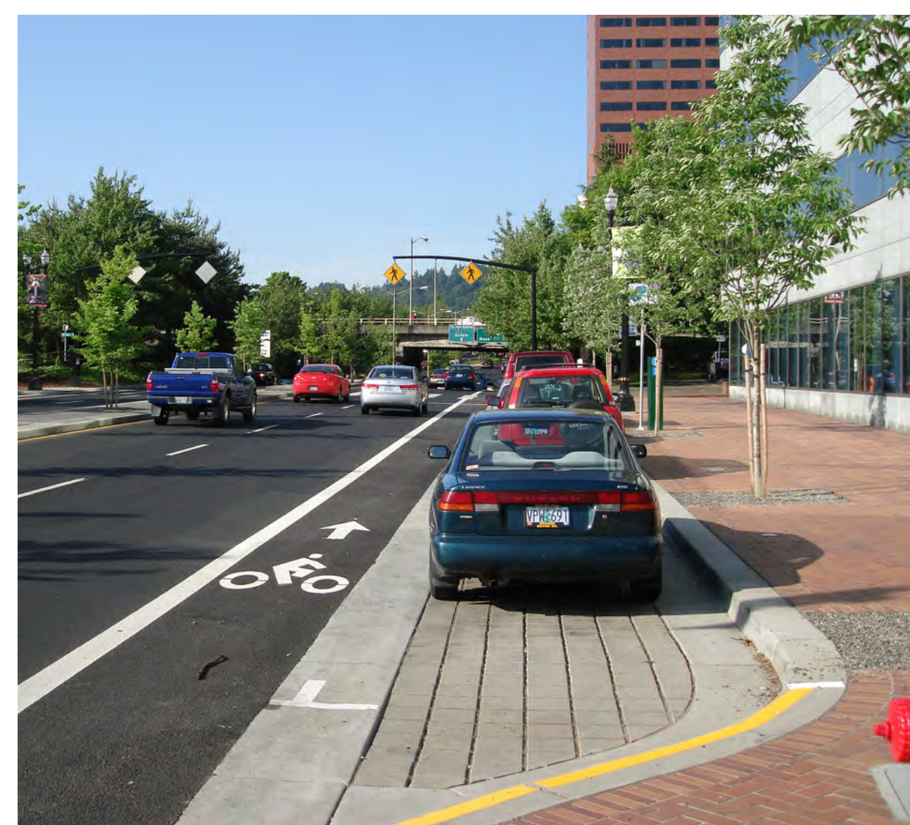
Clearly mark bikeways sharing vehicular roadway