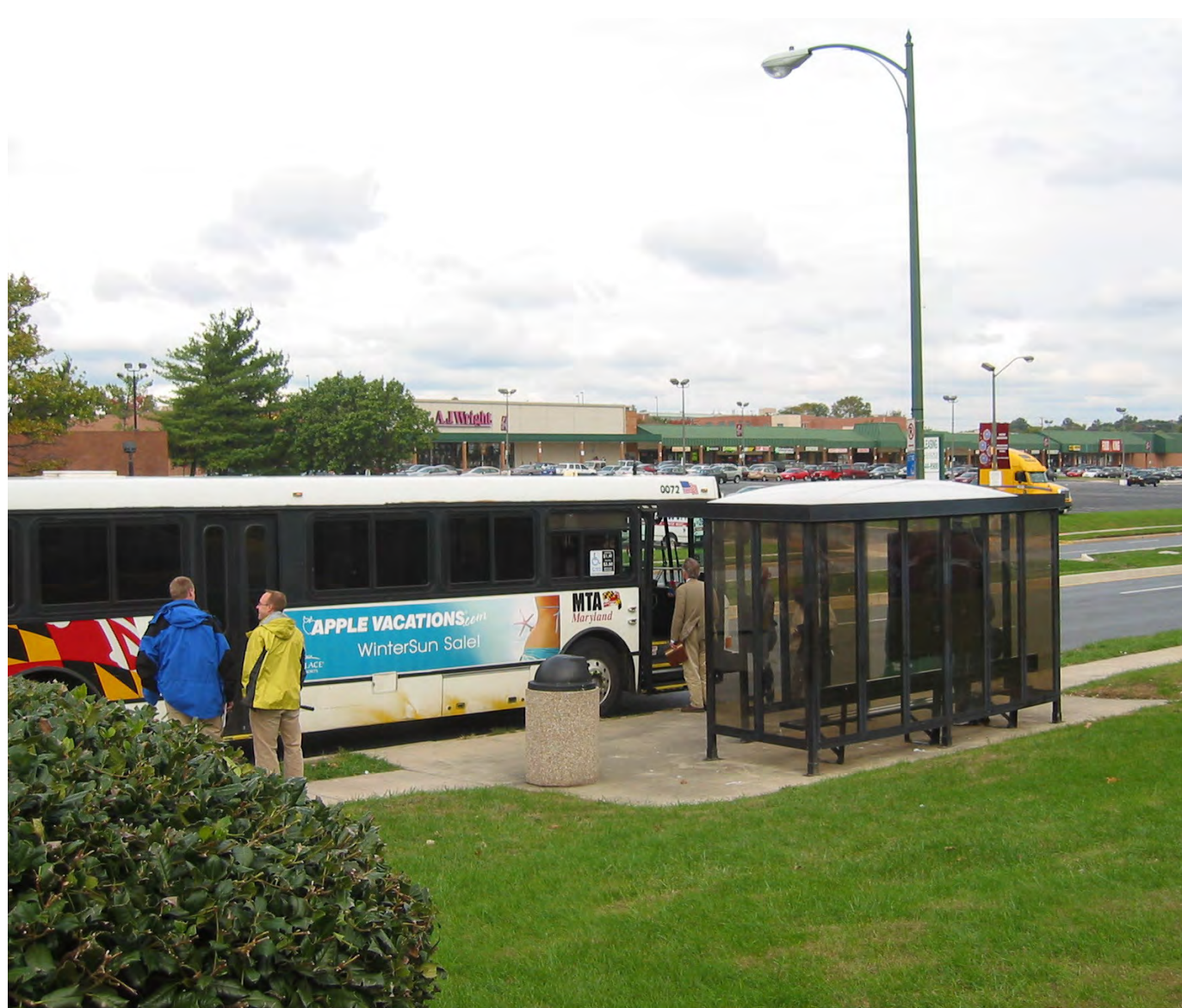
Provide well-designed shelters for transit passengers